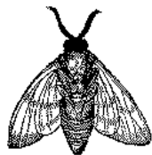
Figure 3: A sample black and white graphic that has been resized with the includegraphics command.

To set a wider table, which takes up the whole width of the page's live area, use the environment table* to enclose the table's contents and the table caption. As with a single-column table, this wide table will “float” to a location deemed more desirable. Immediately following this sentence is the point at which Table 2 is included in the input file; again, it is instructive to compare the placement of the table here with the table in the printed output of this document.